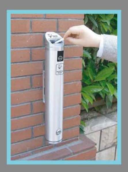
New Cigarette Bin