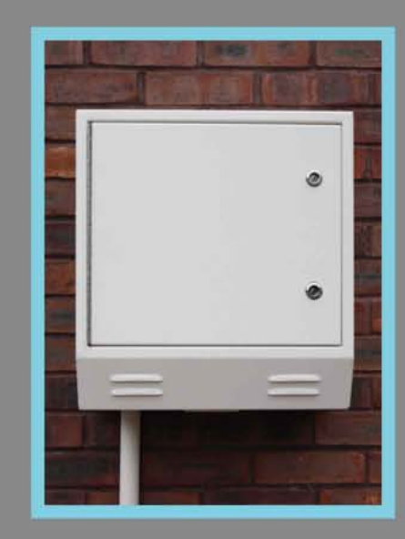
OB2 hook on overbox