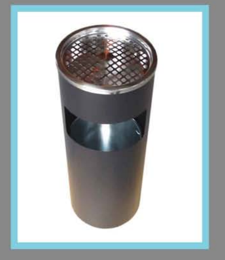
Lobby Style Cigarette Bin