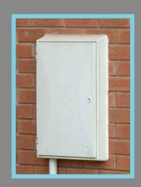
Semi Recessed Gas Box