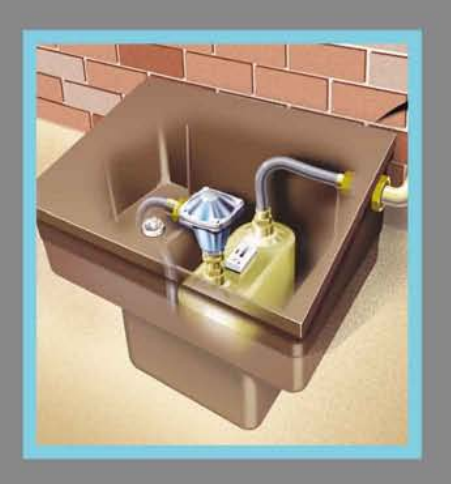
OB10 semi submersible lids