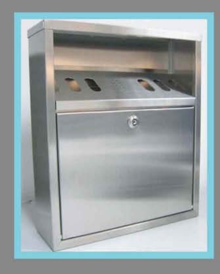
Best Value Cigarette Bin