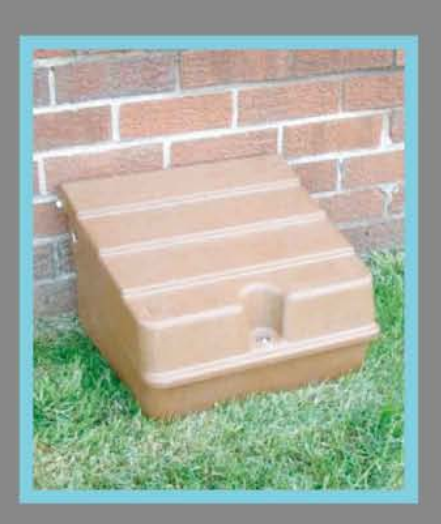
Semi Submersible Gas Meter Box