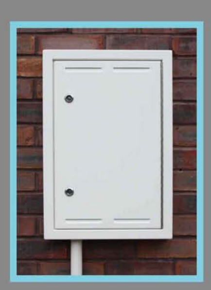
OB8 Illustrated (Gas)

Our range of aluminium overboxes have been specifically designed as new covers for broken or vandalised gas and electric meter boxes.